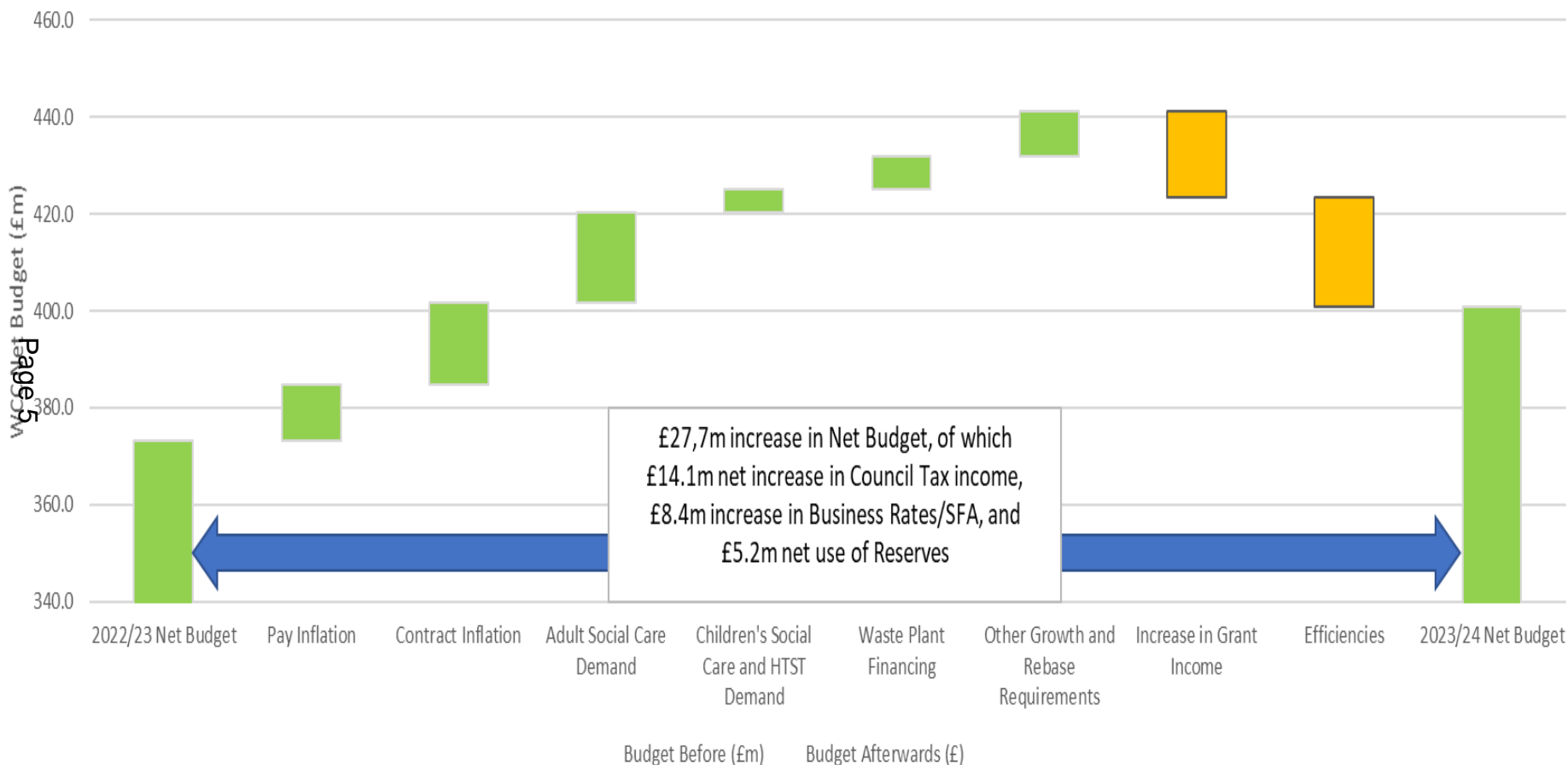
WCC Budget Changes 2022/23 to 2023/24